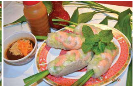
Transparent Prawn & Pork Roll

Relax and Enjoy authentic and traditional Chinese and Vietnamese Cuisine in an elegant atmosphere with the Friendly and Courteous staff. BEN'S Restaurant has been established since 1993 and specialise in Chinese and Vietnamese food.