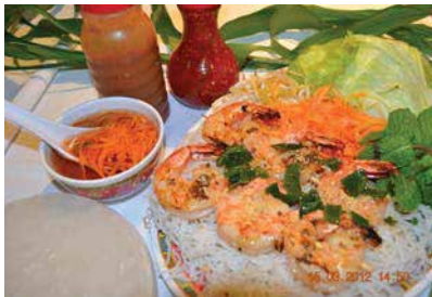
Grilled King Prawn with Salad